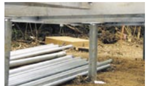
Cap Plate connects equipment platform to Type HS or HS/SS Combo Pile foundations