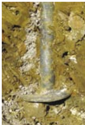
Cutaway close up of drive end bearing on shallow rock stratum

The 278 Pile System transfers loads to the end of its steel shaft (2 \frac{7}{8} "-diameter pipe, 0.203" wall). Special design's 10" drive plate penetrates rugged soil and blunt shaft end bears on solid rock. For more details, see Bulletin No. 01-0501.